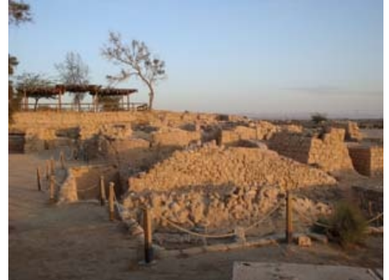
Part of the archaeological dig at Biblical Tamar Park.

These pictures were taken at Biblical Tamar Park south of the Dead Sea in Israel.