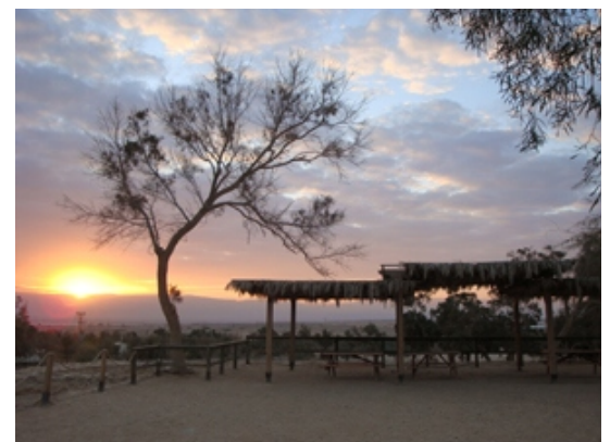
Looking east: sunrise over the Edom (red) Mountains in Jordan.