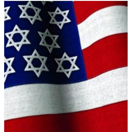
More than friends, we are family.

Then you can find your place and join the Conqueror!