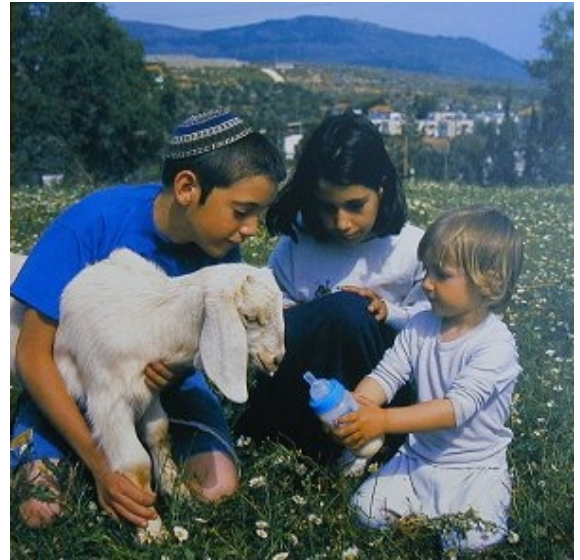
Children play in the shadow of Mount Gerazim and Mount Ebal, the Mount of blessing and the Mount of curses, near Shechem where Joseph is buried. It is only a matter of time that Joseph’s descendants return. “And you shall dwell in the Land that I gave to your fathers, and you shall be my people, and I will be your God.”

Nutritional Value: Weizmann scientists have improved the nutritional value of commercial wheat, almost doubling its protein yield.