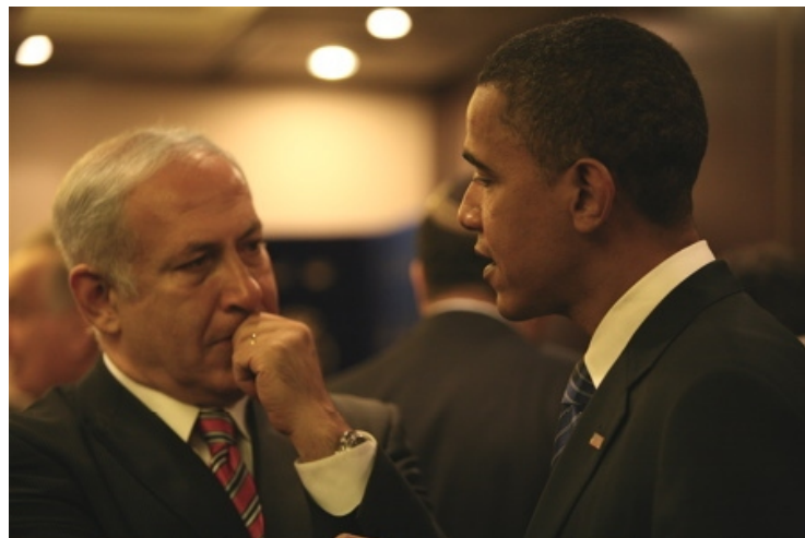
Israel's Prime Minister Netanyahu and President Obama. A character study. Israel is being pressured to negotiate a two-state arrangement without the Palestinians recognizing a Jewish state. That busted equation equals zero.

Of the 191 member nations of the United Nations, 190 may be elected to serve a term on the powerful Security Council. Israel is the only nation not allowed membership on the Security Council. Libya and N. Korea, for example, and Syria has not only been elected but has even chaired the Security Council. The Arab block have a permanent representative on this important body and the UN is turned in to a forum for bashing the Jewish state. Of the 690 UN General Assembly resolutions voted after 1990, 429 were directed against Israel. The UN spends millions per year to promote the Palestine cause. Among other things, that involves producing anti-Israel pamphlets for distribution.